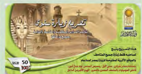
Annual pass for pupils of Egyptian governmental (secondary), private and international schools in Egypt