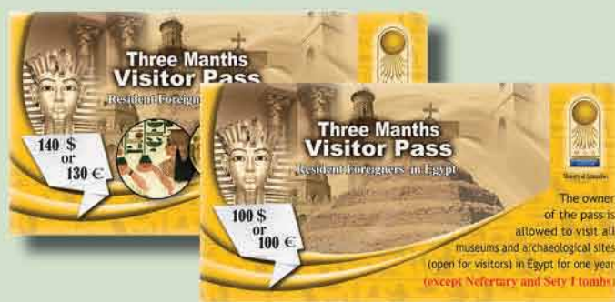
Three months pass for foreign residents in Egypt