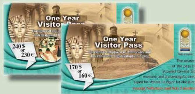
Annual pass for foreigners employed by embassies and international organizations in Egypt