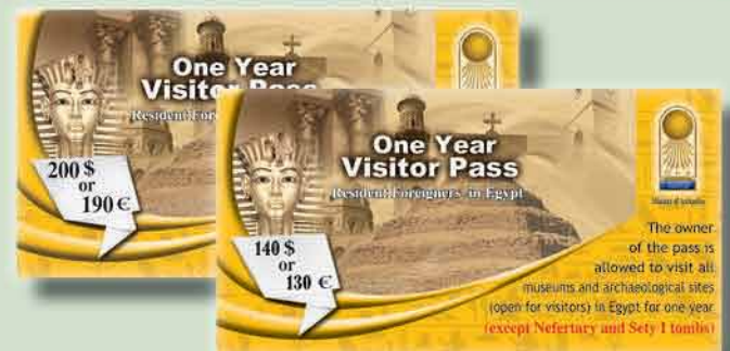
Annual pass for foreign residents in Egypt