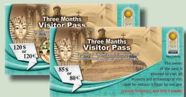
Three months pass for foreigners employed by embassies and international organizations in Egypt

To purchase the pass: Original Passport + One Personal Photo *New ticket prices for Egyptians starting from April 2018*