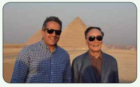
The Minister of Antiquities and the Minister of Tourism accompanied the Vice-President of China on his visit to the Giza Pyramids (27 October).