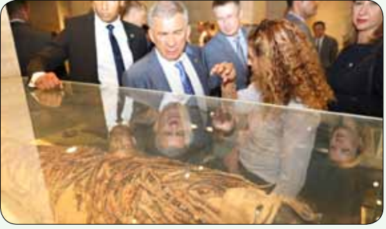
The Minister of Antiquities welcomed the President of Tatarstan and his accompanying delegation at the Egyptian Museum in Cairo (15 October).