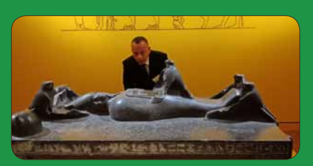
• The "Sunken Cities: The Magical World of Egypt" temporary exhibition was opened in the State of Minneapolis in the United States of America. The exhibition includes 293 objects (29 October 2018 – 29 April 2019).