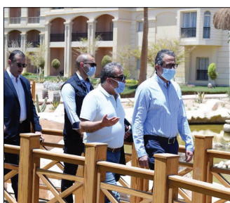
Visits of H.E. the Minister of Tourism and Antiquities in governorates p. 3

https://twitter.com/TourismandAntiq/status/1265614244235612162?s=08