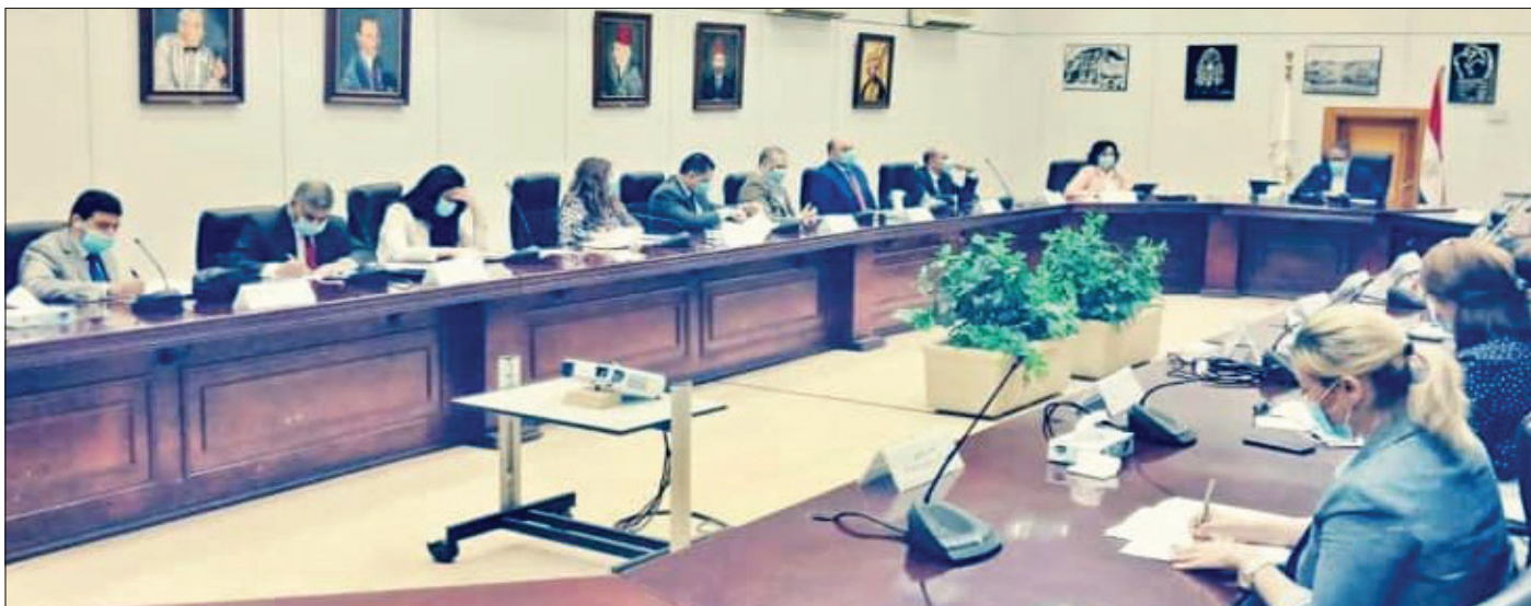
H.E. the Minister during the crisis committee meeting

In May, H.E. the Minister of Tourism and Antiquities chaired the fourth meeting of the Crisis Committee at the Ministry of Tourism and Antiquities. This committee was formed in the aftermath of the Coronavirus crisis. It includes the Deputy Minister for Tourism Affairs, the Chairman of the Egyptian Tourism Federation, the heads of tourist associations, representatives from the Ministry of Information, the Cabinet, security and surveillance authorities, and a number of the Ministry of Tourism and Antiquities.