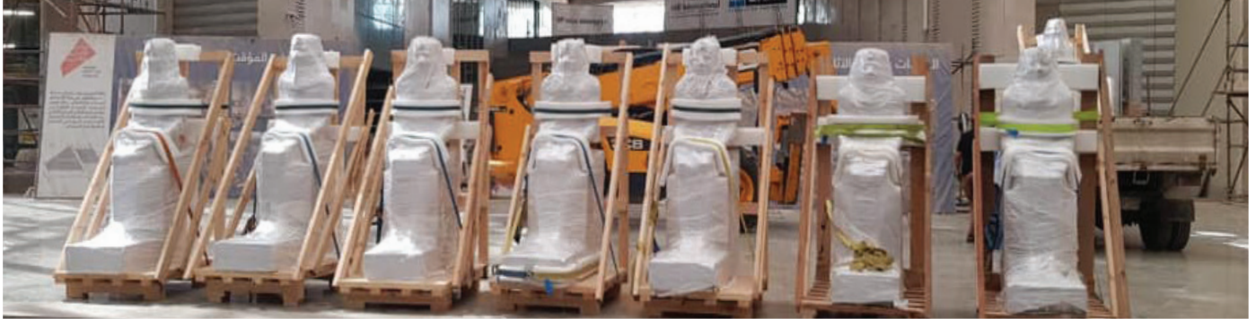
Statues of King Senusret I

The Grand Egyptian Museum received 346 artefacts from the Egyptian Museum at Al-Tahrir, the most important of which are ten statues belonging to King Senusret I of the 12 th Dynasty. Those statues were left in the Grand foyer, before placing them at their permanent place of display in the museum. In a related context, the Egyptian Grand Museum received 42 wooden pieces from the second Khufu Solar Boat, after extracting them from their pit near the pyramid of King Khufu at the Pyramids area in Giza, where they underwent restoration work in the archaeological laboratory located on the site.