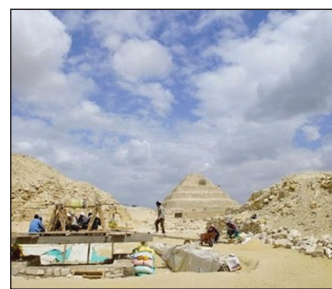
New discoveries in the mummification workshop, Saqqara P. 6