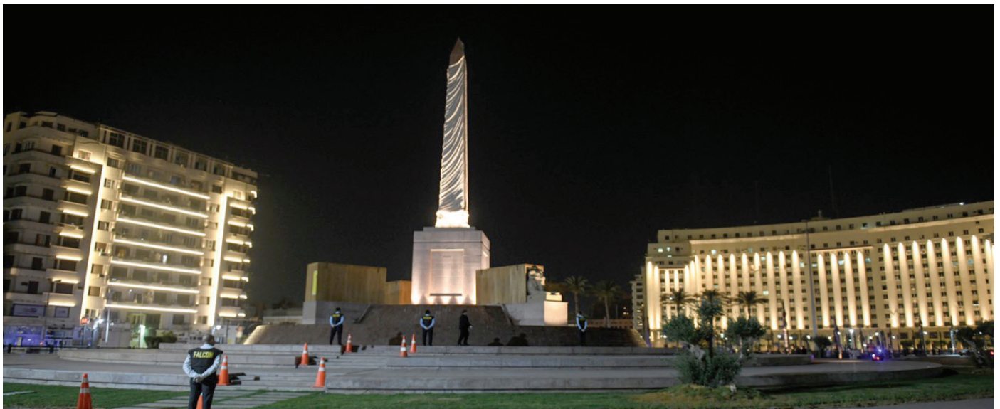
The development works of Al-Tahrir Square

The transfer of the four ram-headed sphinxes to Al-Tahrir Square in central Cairo was successfully completed in May, after their restoration was done during previous months. The four sphinxes were placed around the obelisk of Ramesses II from Tanis, which was restored and erected in the middle of the square. The four ram-headed sphinxes were covered with wooden boxes until the inauguration of Al-Tahrir Square development project.