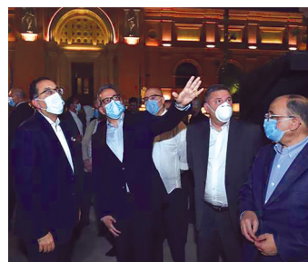
H.E. the Prime Minister visits Tahrir Square P. 4