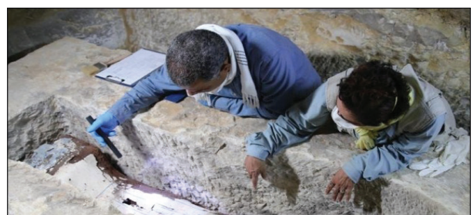
Part of the excavation

An international team of archaeologists and chemists from the University of Tübingen, the University of Munich, and the Egyptian National Research Centre in Cairo carried out chemical testing on the residue of oils and resins preserved in cups, bowls, and pots found in the mummification workshop. Early results of these tests list mummification substances, including bitumen (tar), cedar oil, cedar resin, pistachio resin, beeswax, animal fat, and possibly olive oil and juniper oil. The team is currently finalising the report for scientific publication.