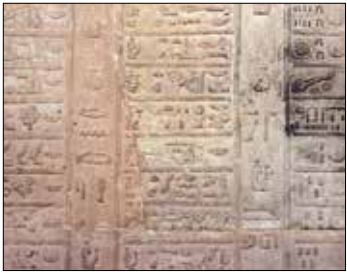
The Ancient Egyptian Calendar p. 3