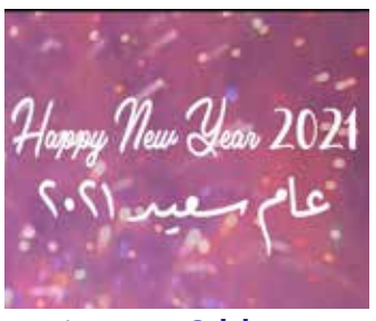
A song to Celebrate a New Year p. 3