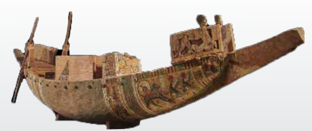
Model of a boat from Amenhotp the 2nd collection. New kingdom