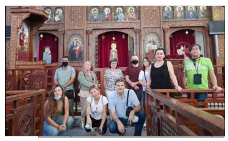
Visits of the Serbian delegation in Egypt

The Egyptian Tourism Promotion Board in coordination with the Egyptian Ambassador in Belgrade, organized a fam trip to Egypt for a Serbian media delegation with 12 senior journalists, media officials and social media influencers, from 28 November until 5 December. The delegation visited Cairo, Giza, Hurghada and Luxor. They praised the precautionary measures and hygiene safety regulations implemented in tourism facilities to counter the spread of COVID-19 and said they will transfer their experience through their writings to promote Egypt in Serbia. The delegation met with Vice Minister of Tourism and Antiquities for Tourism, where she discussed Egypt's efforts to support the tourism sector during the COVID-19 crisis, and the facilities put forward to encourage international tour operators to organize trips to coastal governorates.