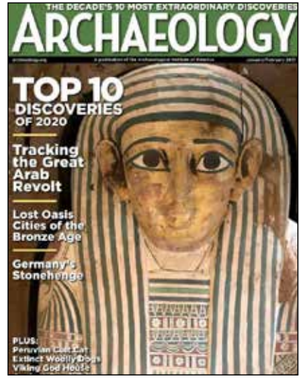
The Cover of the Magazine

This archeological discovery included more than 100 colored wooden, sealed coffins containing mummies in good condition of preservation and are almost 2,500 years old. These coffins were found in 3 burial shafts and belonged to senior statesmen, officials and priests of the temple of the goddess Bastet in the 26th Dynasty.