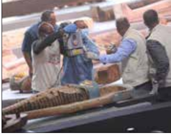
Saqqara Discovery Among the Top 10 of 2020 p. 3