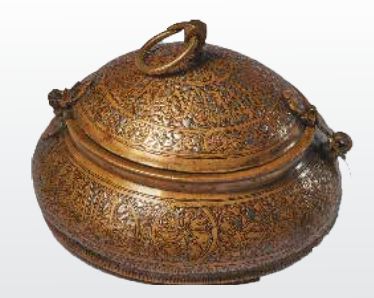
A vessel of copper inlaid with silver, decorated with floral designs and writings.-Islamic period