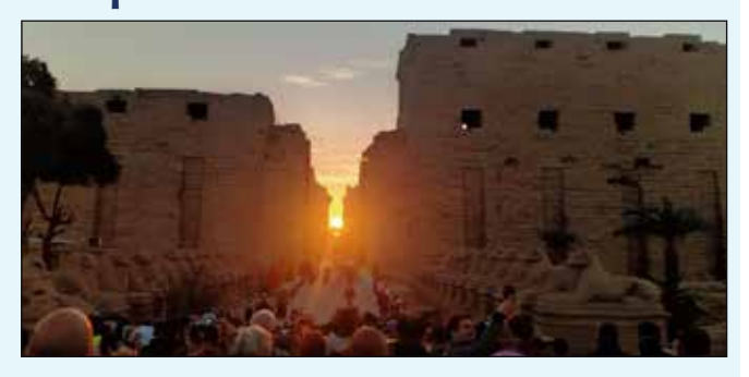
On 21 December, the temples of Karnak witnessed a solar alignment on the main axis of the Karnak Temple. A phenomenon that occurs on this day every year. This date coincides with the beginning of the winter season. A large turnout of Egyptian and foreign visitors at the temples watched this phenomenon.