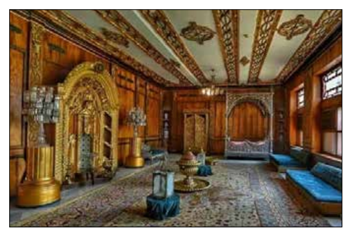
Prince Muhammad Ali Palace in Manial