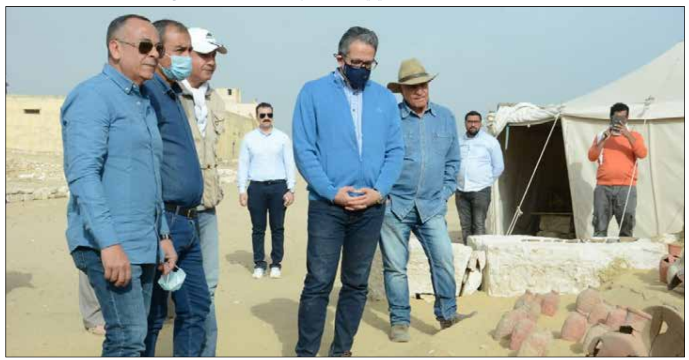
The Minister visiting the site of the New discovery

The Minister, accompanied by Dr. Zahi Hawass, former Minister of Antiquities, and Secretary General of the Supreme Council of Antiquities, visited the excavations of the Egyptian archaeological mission working next to the Pyramid of King Titi I in Saqqara archeological site. The mission is headed by Dr. Zahi Hawass. Excavations resulted in the discovery of burial shafts with coffins and huge archaeological findings from the New Kingdom. This discovery will be announced early 2021.