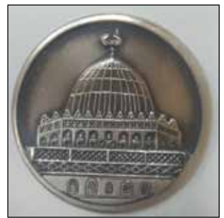
The Commemorative Medals