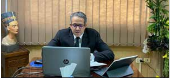
The Minister during the Conference

The Minister participated in the conference organized by Spain in cooperation with the World Travel and Tourism Council (WTTC) and the UNWTO, via video conference. The meeting discussed the resumption of tourism worldwide and how to support the recovery of the tourism sector after the crisis of the Corona Virus pandemic. The Prime Minister of Spain and a number of tourism ministers from around the world attended the conference.