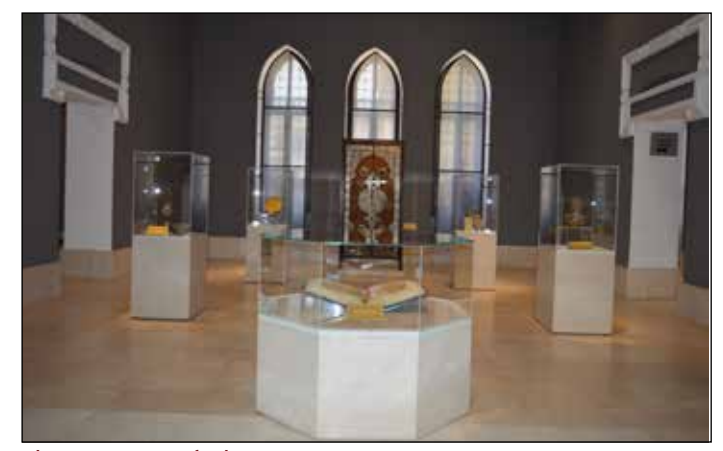
The Museum of Islamic Art

To celebrate the 117th anniversary of Prince Muhammad Ali Palace in Manial, Egyptians were given free entry to it on December 24. The minister also gave Egyptians free entry to the Museum of Islamic Art in Cairo on December 28, on the occasion of the 117<sup>th</sup> anniversary of its opening.