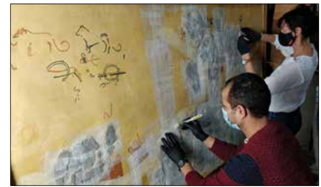
Restoration work on the Mural

The archaeological unit in the Goods Village at Cairo International Airport, in cooperation with the FedEx Customs Administration, seized 85 ancient coins from Greeko-Roman, Byzantine, Ptolemaic and Ayubid eras, in addition to three small scarabs, before being smuggled out of the country. These objects were hidden inside magic pockets with a parcel sent to the United States of America via mail.