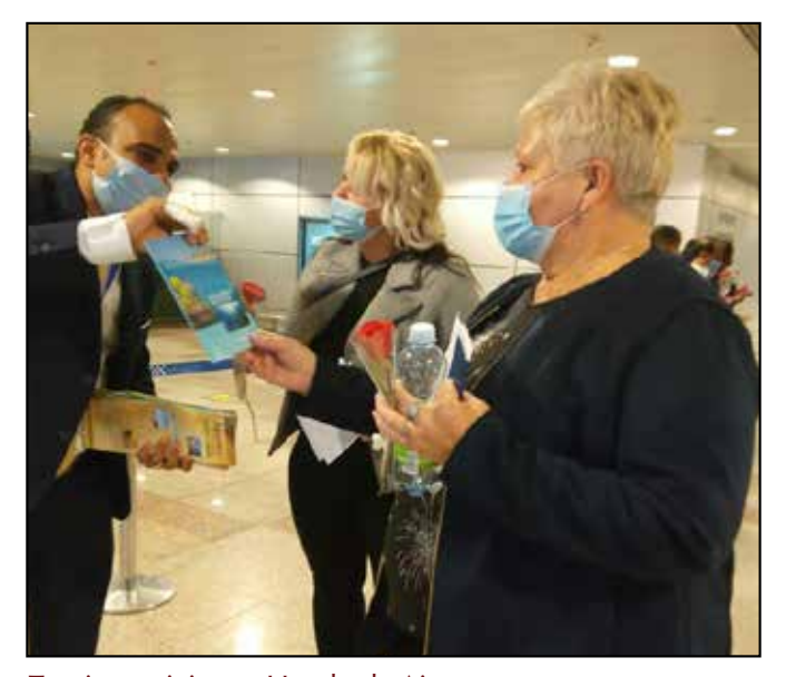
Tourists arriving at Hurghada Airport

On Tuesday 15 December, the decree of the Egyptian Cabinet granting tourist visas to tourists with valid, previously used visas from the United States of America, the UK or Schengen countries, arriving at all Egyptian airports, was activated. This is a positive step towards In a related context, Hurghada received, the first tourist groups visiting Egypt from Berlin, Germany and Bratislava, Solvakia after the resumption of tourism early July. These trips are an outcome of efforts of the Egyptian Ministry of Foreign Affairs and the Egyptian Embassies in Germany and Slovakia, in coordination with the Ministry.