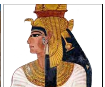
Women in Ancient Egypt p. 12