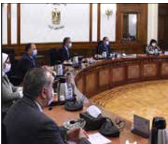
The PM Chairs the Meeting of the Ministerial Committee for Tourism and Antiquities p. 2

The Replicas factory has manual and mechanized production units, and an exhibition hall. It employs around 150 experienced artists, restorers and craftsmen, most of them are from the ministry.