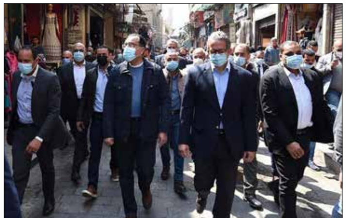
The PM's visit in Historic Cairo

On 13 March, The Prime Minister visited Historic Cairo accompanied by the Minister. This visit aimed to review the details of proposed projects to be implemented for the development of the area, based on presidential mandates to intensify work on projects to revive Historic Cairo to restore its splendour while preserving its monumental buildings and architectural heritage. During the PM's visit, the head of Islamic, Coptic, and Jewish antiquities in the Ministry reviewed the development plan in Fatimid Cairo, which includes Al-Muizz Street, Wekalet El Ghoury, and Al-Khayameya Street.