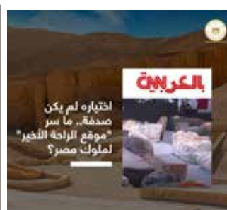
Egypt in The Spotlight p.6