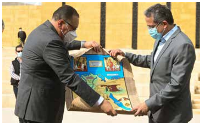
During the opening of the development project of Tel Basta

The Minister, Minister of Local Development, and Governor of Sharkia opened the development project of the Tel Basta site in Sharkia Governorate, one of the eastern points on the path of the Holy Family Journey in Egypt. It includes the well that the Holy Family passed by, which is located in the middle of an archaeological site. The Minister also inaugurated an exhibition for Egyptian Heritage.