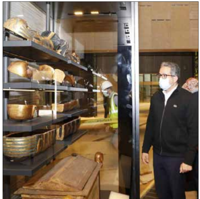
The Minister overseeing the hall of Tutankhamun

The Minister visited the Museum on 7 March to follow up on the progress of work. He was accompanied by the supervisor of the Museum project and the surrounding area, the Secretary General of the Supreme Council of Antiquities, and the Assistant Minister for Archaeological Affairs in the museum. The Minister oversaw archaeologists and restorers placing the first artifacts of King Tutankhamun's treasures in their exhibition halls amid strict security measures. In a related context, The Museum received the fourth shrine of King Tutankhamun from the Egyptian Museum in Tahrir. It is made of gilded wood and is part of the display scenario of the halls of the treasures of the Boy King. It is considered one of the largest artifacts that have been transferred from King Tut's treasures so far to the museum. The shrine was restored and assembled inside its show case on 18 March.