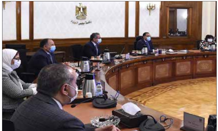
Part of the meeting of the Ministerial Committee

On 28 March, the Prime Minister chaired the meeting of the Ministerial Committee for Tourism and Antiquities, in the presence of the Minister, and Ministers of Culture, Finance, Local Development, Health and Population, Environment and Civil Aviation, and head of the Military Museums Department, assistant to the Minister of Interior for Tourism, and the Chairman of the Egyptian Tourism Federation. The Committee followed up on the final arrangements for the Pharaohs' Golden Parade scheduled for 3 April 2021. They also reviewed inbound tourism movement to Egypt from January 2020 to February 2021, where the Minister indicated that more than 2 million tourists visited Egypt since the resumption of tourism, from July 2020 to February 2021. During the meeting, it was agreed to continue with the measures taken to support the tourism sector, until 31 October, 2021, in preparation for submitting them to the Cabinet. The Ministerial Committee reviewed the latest developments related to the tourism sector.