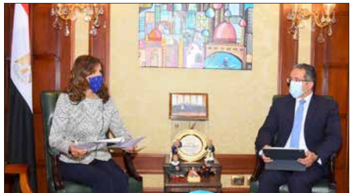
Part of the meeting with the Minister of Immigration

The Minister held a meeting with the Minister of State for Immigration and Egyptian Expatriate Affairs. They discussed preparing special programs for Egyptian expatriates to visit touristic and archaeological sites and museums in Egypt, and coordinate with them to promote Egyptian destinations.