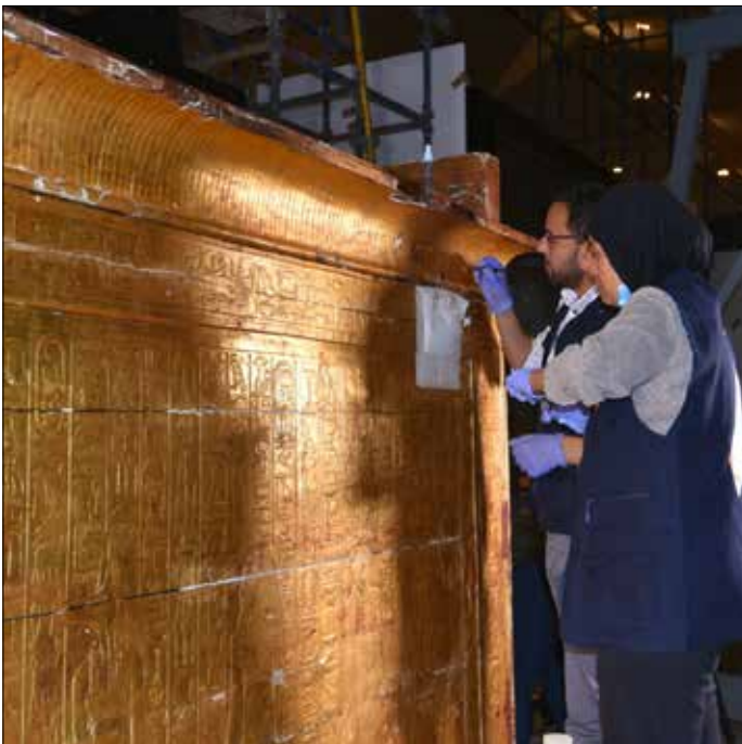
During the restoration work of the shrine of Tutankhamun