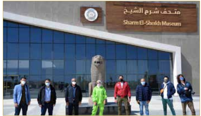
Influencers in front of Sharm El-Sheikh Museum

The Egyptian Tourism Promotion Board (ETPB) organized this month visits and Fam trips for famous foreign, Egyptian and Arab social media influencers. ETPB organized a visit to South Sinai for a number of Egyptian influencers with between 500k and two million followers on various social media platforms, to raise awareness about touristic destinations and archaeological sites. CEO of the Egyptian Tourism Promotion Board and Head of the Islamic, Coptic and Jewish Antiquities Sector at the Supreme Council of Antiquities, accompanied the influencers on a tour in Sharm El-Sheikh and Saint Catherine.