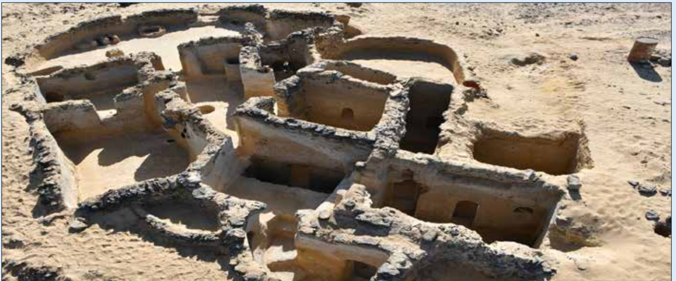
Part of the discovery

During its third season, the Norwegian-French archaeological mission working in Qasr Al-Agouz in Bahariya Oasis revealed this month a number of buildings made of basalt stone, carved into rocks and buildings constructed of mud bricks, which date back to between the fourth and seventh centuries AD. The discovery included the remains of three churches and some monks' clauses, and the walls bear scribes and symbols bearing Coptic inscriptions. This discovery is very important because it provides insights on how buildings were constructed in this period and gives an understanding of the formation of the first monastic congregations in Egypt in this region.