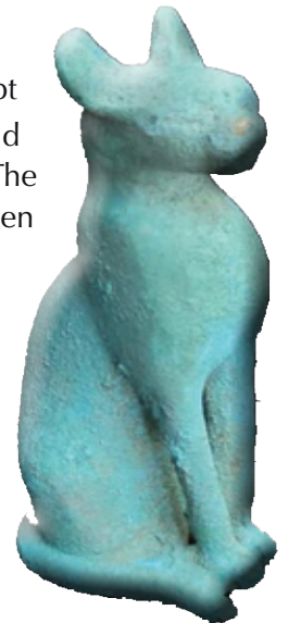
The statue of Bastet

In line with the efforts of the diplomatic missions and the Ministry to repatriate Egyptian antiquities smuggled abroad, the Egyptian ambassador to Canada received on 9 March a bronze artifact of the Goddess “Bastet” belonging to the ancient Egyptian civilization. This came as a result of joint efforts and close cooperation between the Egyptian Embassy in Canada and the Ministry on the one hand, and the concerned Canadian authorities on the other side.