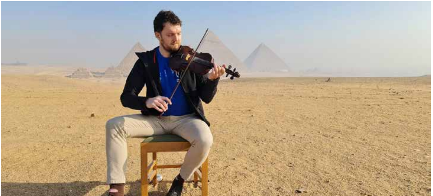
The Irish musician playing in front of the Pyramids

The Embassy of Ireland in Cairo chose the Giza Pyramids to celebrate St. Patrick’s Day, Ireland’s National Day. On this day, the embassy released a short movie for a musical performance of Irish heritage played by an Irish musician in front of the Pyramids, in the presence of Ambassador of Ireland in Cairo.