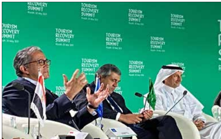
The opening session of the “Tourism Recovery” summit

The Minister, participated in the opening session of the “Tourism Recovery” summit held within the framework of the 47 th meeting of the Middle East Regional Committee of the World Tourism Organization. It was inaugurated by