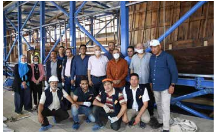
The team working on Khufu Solar Boat

On 5 May, the Secretary-General of the Supreme Council of Antiquities followed up on the progress of work in the process of the transportation of the first Khufu Solar Boat from its current display site at the Khufu Boat Museum in the Giza Plateau to its new display place at the Grand Egyptian Museum. The packaging and reinforcement work on the body of the boat is conducted in accordance with scientific international standards. The restoration team performed a comprehensive cleansing of the body of the boat before the reinforcement work taking very good care of the safety of all parts of the boat during the transfer, in addition to using of acid-free materials in the packaging process.