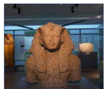
Opening 2 Museums at Cairo Airport on International Day of Museums p. 12