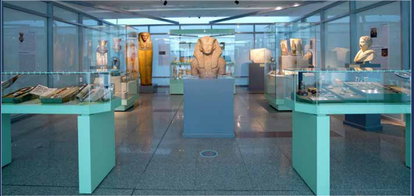
The museum at terminal 2

On 18 May of each year, the world celebrates the International Day of Museums. On this occasion, the Minister and Minister of Civil Aviation inaugurated two antiquities museums in Terminal 2 and Terminal 3 of Cairo International Airport. On this day both museums were open free of charge for all travelers. The idea behind those museums is to give travelers a glimpse of the unique treasures of the great Egyptian civilization.