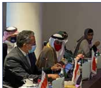
Egypt elected president of the Middle East Regional Committee in the UNWTO p. 3