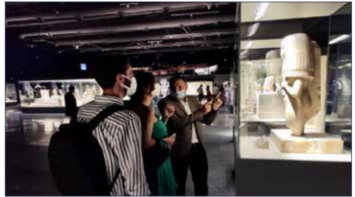
The bloggers in the museum

South Sinai governorate prepared a program for them from May 21 st until May 27 th . It included visiting Sharm El-Sheikh Museum, the old Market and the Sahaba Mosque, in addition to a sea cruise.