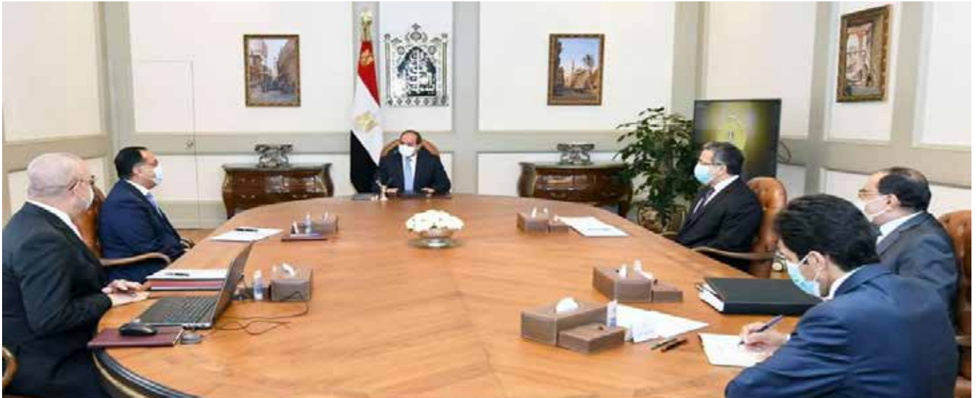
The meeting with H.E. The President

His Excellency the President met on May 29 with the Prime Minister, the Minister, and the Minister of Housing, Utilities and Urban Communities, to follow up a number of current and future projects in the field of tourism development. The meeting discussed efforts to boost inbound tourism to Egypt, the latest developments in the tourism and antiquities sector, the opening of museums, the Grand Egyptian Museum and the development project of the Sphinx Avenue in Luxor.