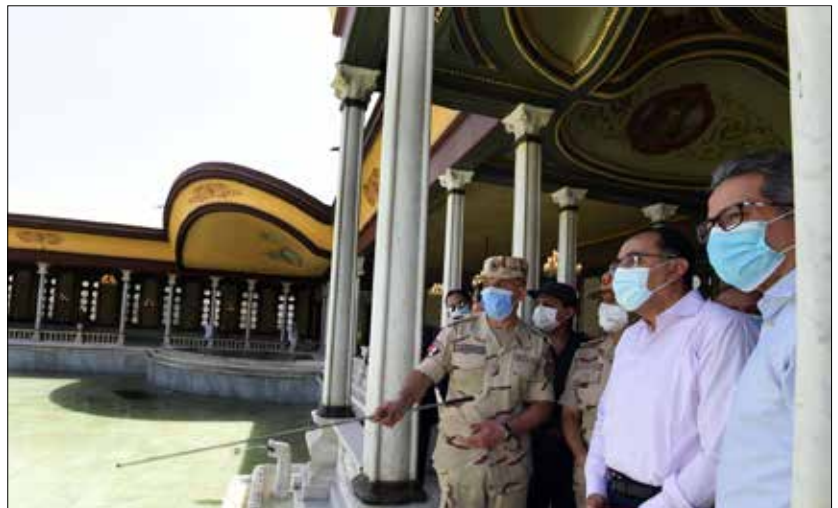
Part of the visit of the PM

On 31 May, the Prime Minister visited the restoration project of Mohammed Ali Palace in Shubra; to follow up on the progress of work there. He was accompanied by the Minister, the Governor of Qalyubia and officials of the Engineering Authority of the Armed Forces. The restoration work of the palace is in full swing, in preparation for its opening. The palace was built in 1808 AD, and the construction process continued until 1821. It consists of the Gabalaya kiosk building, and the Mosaic Palace building. Its construction was supervised by architect Zulfiqar Katkhuda.