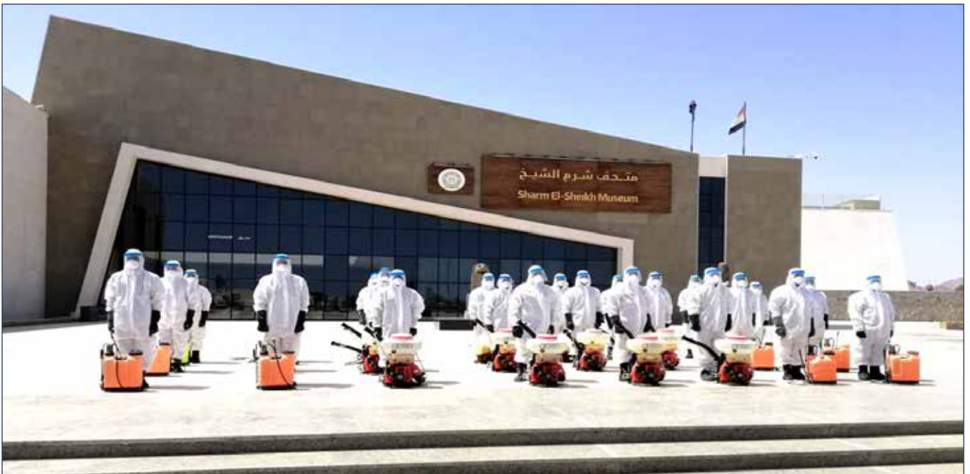
Disinfection and Sterilization of Sharm El- Sheikh museum

During the month of May, the Ministry continued the sanitation and disinfection process of all Museums and archeological sites to provide the maximum protection to workers, citizens, and tourists from the repercussions of the Coronavirus pandemic. The Secretary-General of the Supreme Council of Antiquities visited a number of archaeological sites to follow up on the implementation of these measures. Disinfection and sanitation work is carried out on a daily basis in all museums and archaeological using material approved by the Ministry of Health and Population.