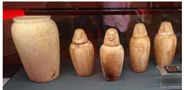
some of the artifacts in the exhibition

includes 90 artifacts from the excavations of the Czech mission in the archaeological area of Abu Sir, including the head of a statue of King “Ra-Nefer-Ef”. In addition to a number of statues from the Old Kingdom, including a statue of a writer, statues of senior statesmen and employees, and a group of canopic jars, in addition to 10 faience ushabti figurines.