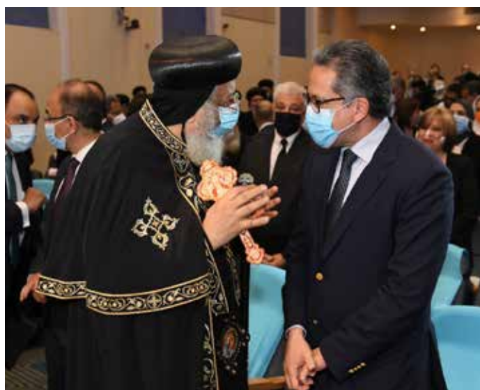
The Minister and His Holiness Pope Tawadros II

During his speech the Minister said that reviving the trail of the Holy Family is one of the most important national projects taking place under the directives of His Excellency President Abdel Fattah El-Sisi and constant follow-up from the Prime Minister. He added that the whole government is working on this important initiative in coordination with the Egyptian Church.