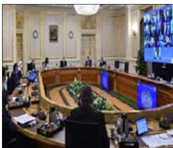
Summer Working Hours are Back for Malls, Cafes and Restaurants p. 2