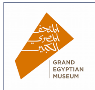
H.E. the President issues a decree forming GEM's board of trustees p.11