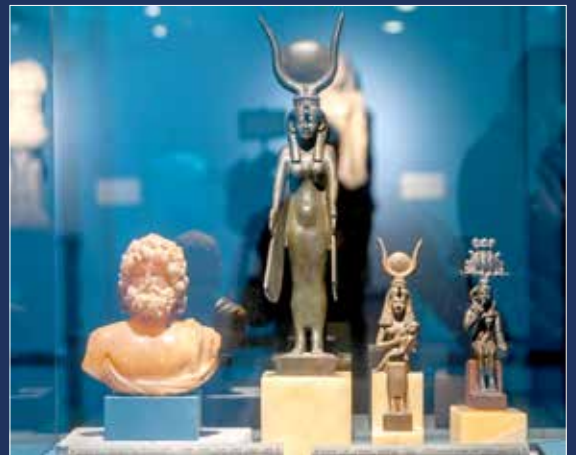
The museum at terminal 3

Each year has a theme and this year it was "The Future of Museums: Recover and Reimagine".