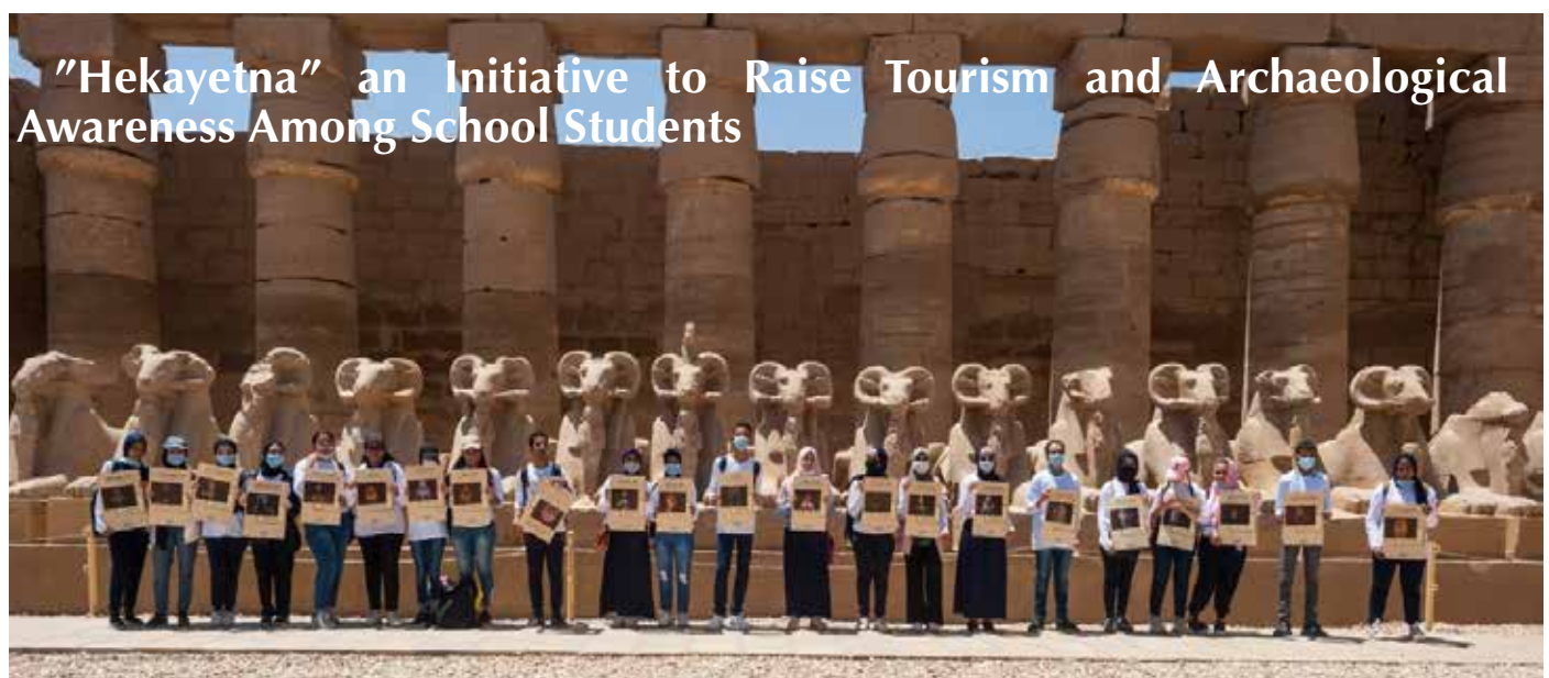
Students from Qena and Luxor visiting Karnak temple

The Department of Cultural Development and Community Communication launched an initiative titled "Hekayetna" (Our story) in cooperation with the Ministry of Education and Technical Education to raise tourism and archaeological awareness among school students; by organizing a number of visits to tourist and archaeological sites in the various Egyptian governorates.